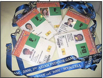
Official Tags Used