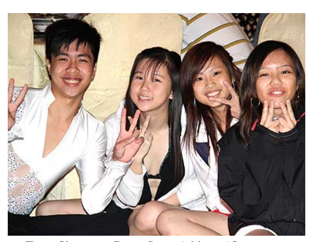
Team Singapore DanceSport Athletes / Supporters