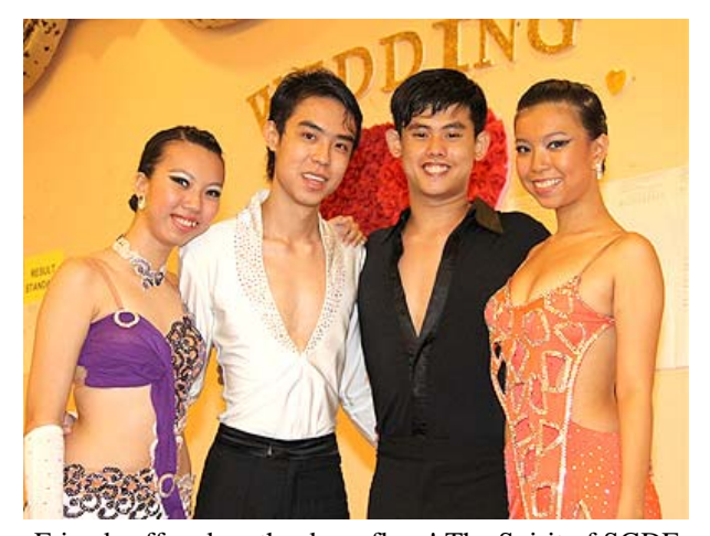
Friends off and on the dancefloor! The Spirit of SGDF

The competition venue was a short 6 minutes walk away from the hotel. With a largely junior competitive team, everyone cheered for one another – as long as it was a Singaporean on the dancefloor. The competition proceeded smoothly, and Singapore returned with 2 Gold, 3 Silver and 2 Bronze medals. Well done Team Singapore!!