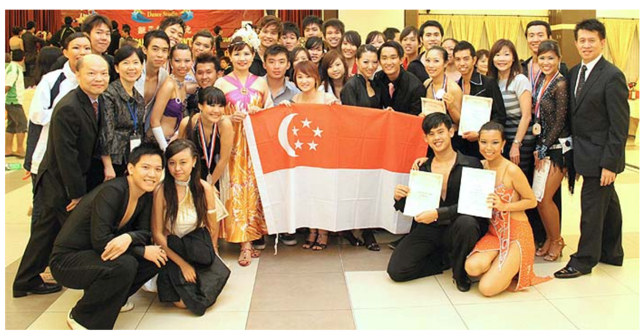
Team Singapore DanceSport in Kulai