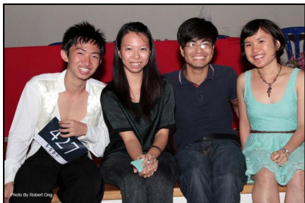
Past and current members of NTU DSA lending their support