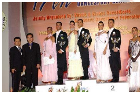
IDSF International Open Standard Prize Presentation