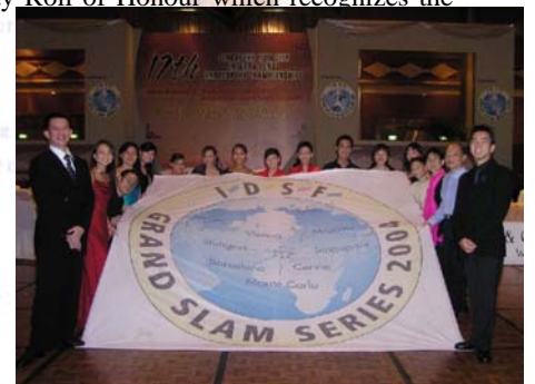
The entire working committee who has made the IDSF GrandSlam & International Open Standard a tremendous success

Moving forward, SGDF thanks our members for the support they have shown for our events and we aim to be able to provide more opportunities for our members, in both the competitive arena as well as the education of DanceSport.