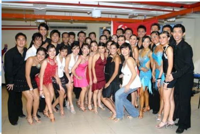
All athletes with officials