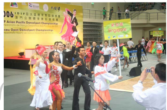
March Pass Parade

More than 360 competitors representing 20 countries participated in the 2-day event, making it a very successful event.