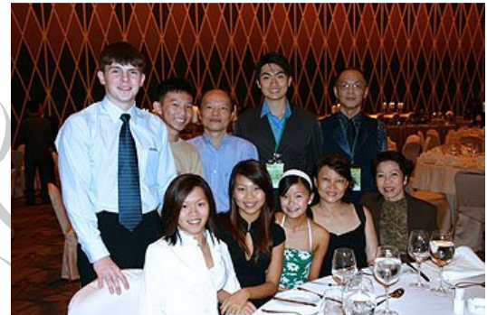
Our Athletes & Officials at the Welcome Party

The Welcome Reception was held at the Macau Fisherman's Wharf on the eve of the Championships. It was a glamorous venue and the athletes and officials were all invited to a fantastic menu.