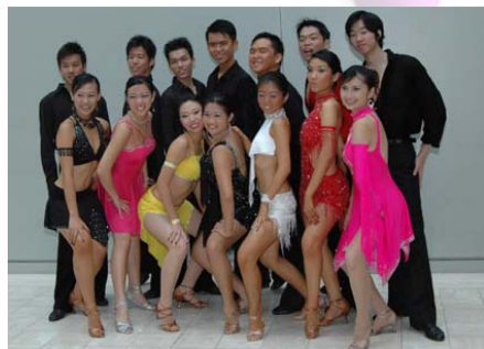
Singapore Poly DanceSport Club