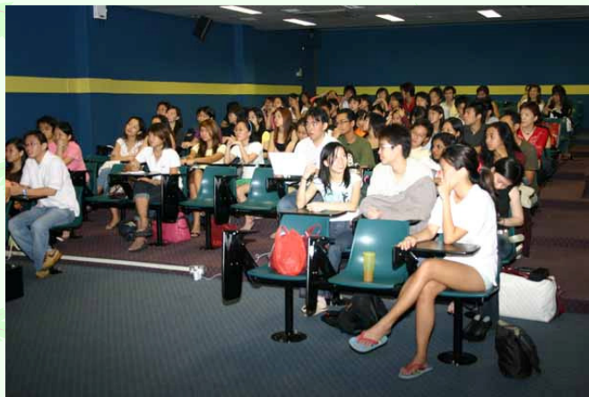
Tertiary club members attending the lecture

Held in Ngee Ann Polytechnic's Auditorium, the half day workshop aimed to provide the tertiary club members an insight to the world of competition grooming as well as to provide essential information on the art of cosmetic enhancement.