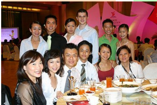
Special Invitation for the SGDF to perform at The 2006 Sports Awards Night